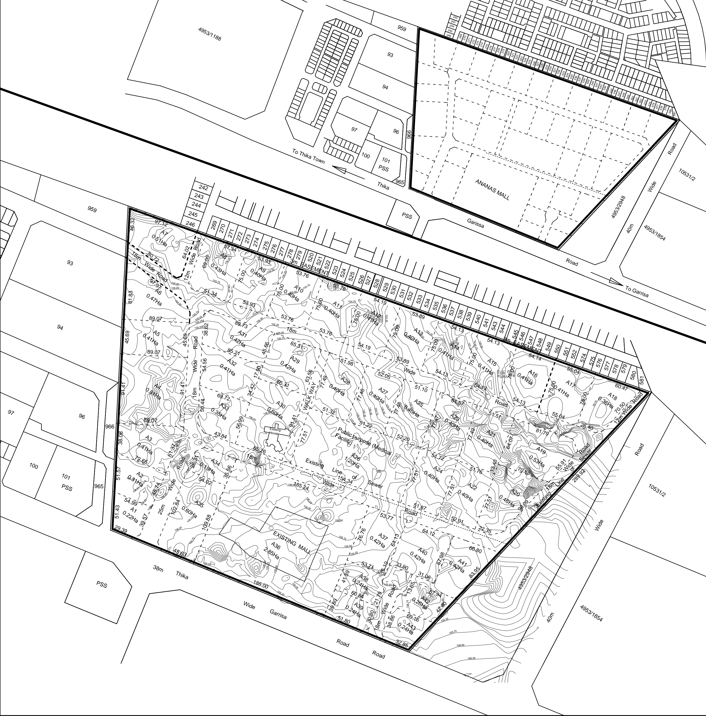
LOCATION DIAGRAM AND APPROVED MASTER PLAN SCALE 1:5000